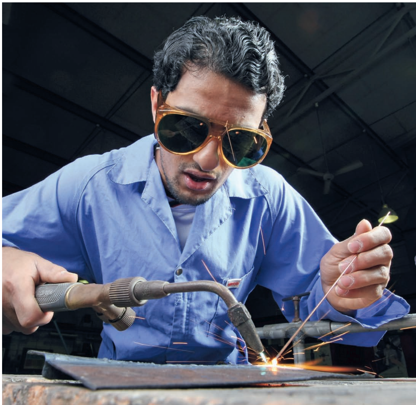
A young Arab is welding a piece of metal in a shop (© ILO/Apex – ILO Arab States Flickr).