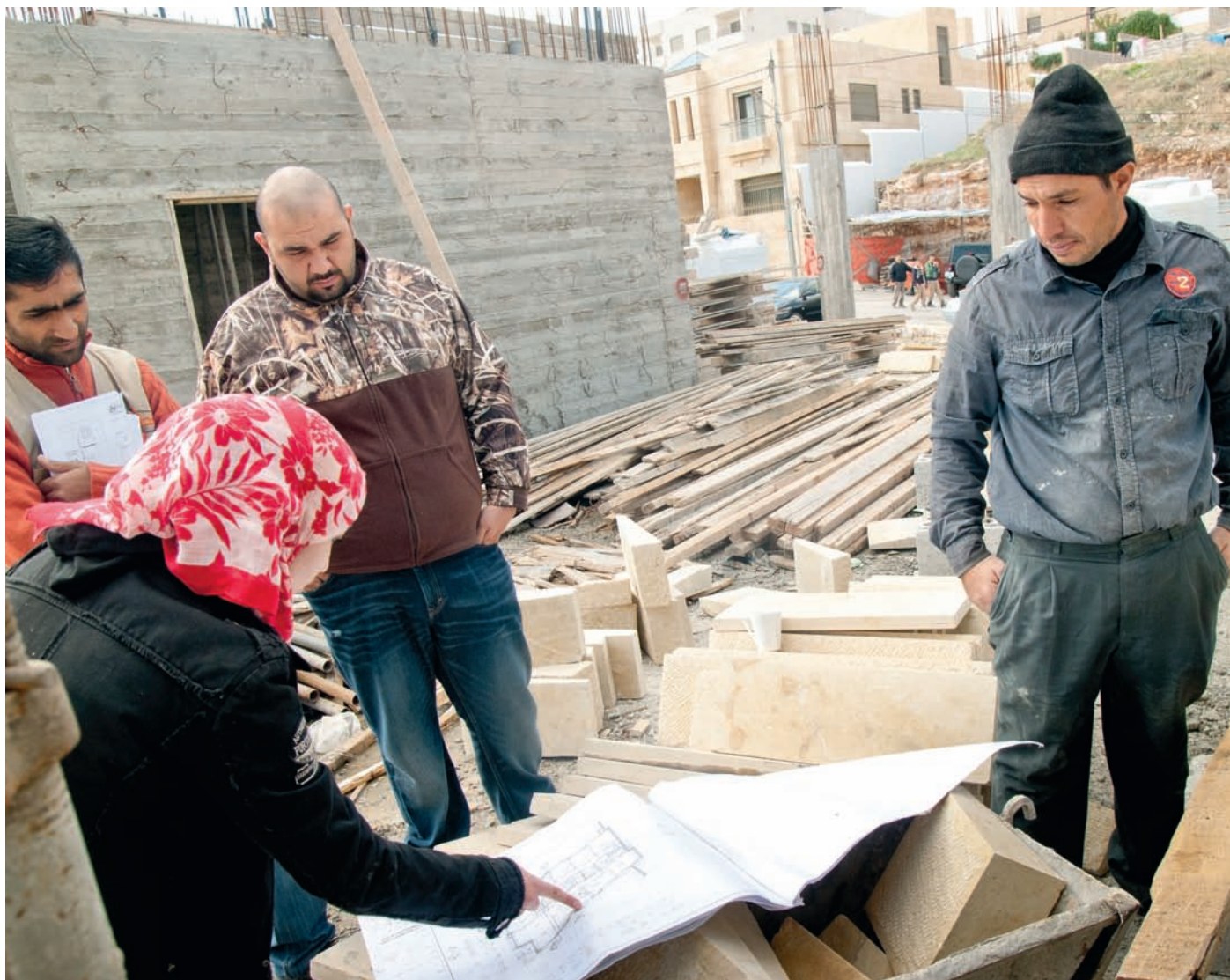
A female construction engineer works as the only woman on a construction site in Amman, Jordan.

The ILO helps to identify policies that create and maintain decent work and income through policies that are formulated by governments, employers and workers in a comprehensive Global Employment Agenda.