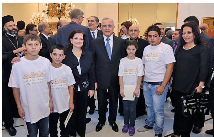
President Michel Sleiman with children at the Presidential Palace.

http://www.ilo.org/beirut/events/WCMS_222881/lang--en/index.htm