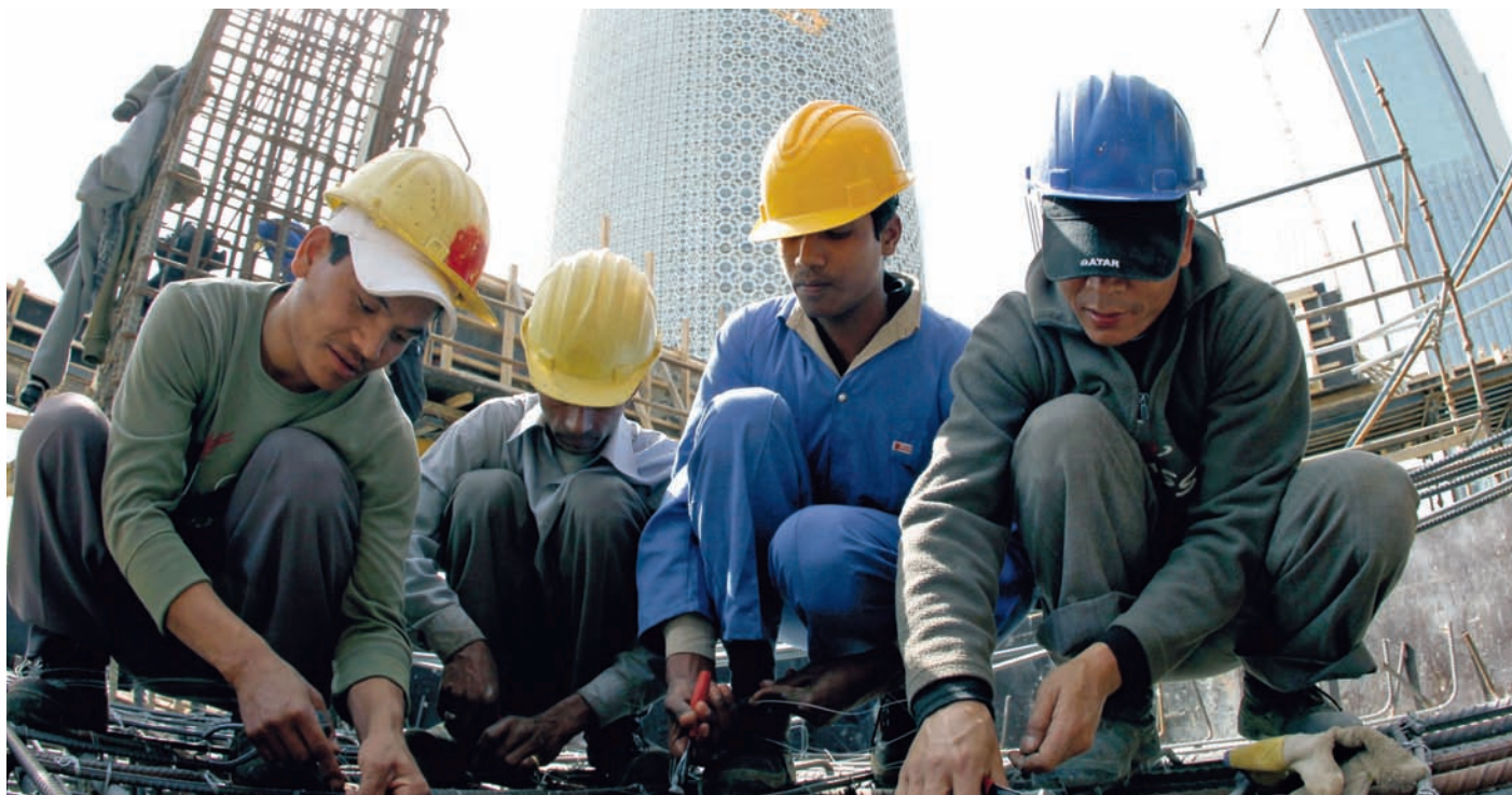
Migrant workers fasten metal rods together at a construction site (© ILO/ Apex Image - ILO Arab States Flickr).

In the Middle East, the proportion of migrant to local workers is amongst the highest in the world, particularly in the Gulf Cooperation Council states. In Qatar, over 90 per cent of workers are foreign while in Saudi Arabia that figure exceeds 70 per cent. In Jordan and Lebanon, migrants also make up a significant part of the workforce, particularly in sectors such as construction and domestic work. The ILO estimates that almost half of migrant workers in the region are women.