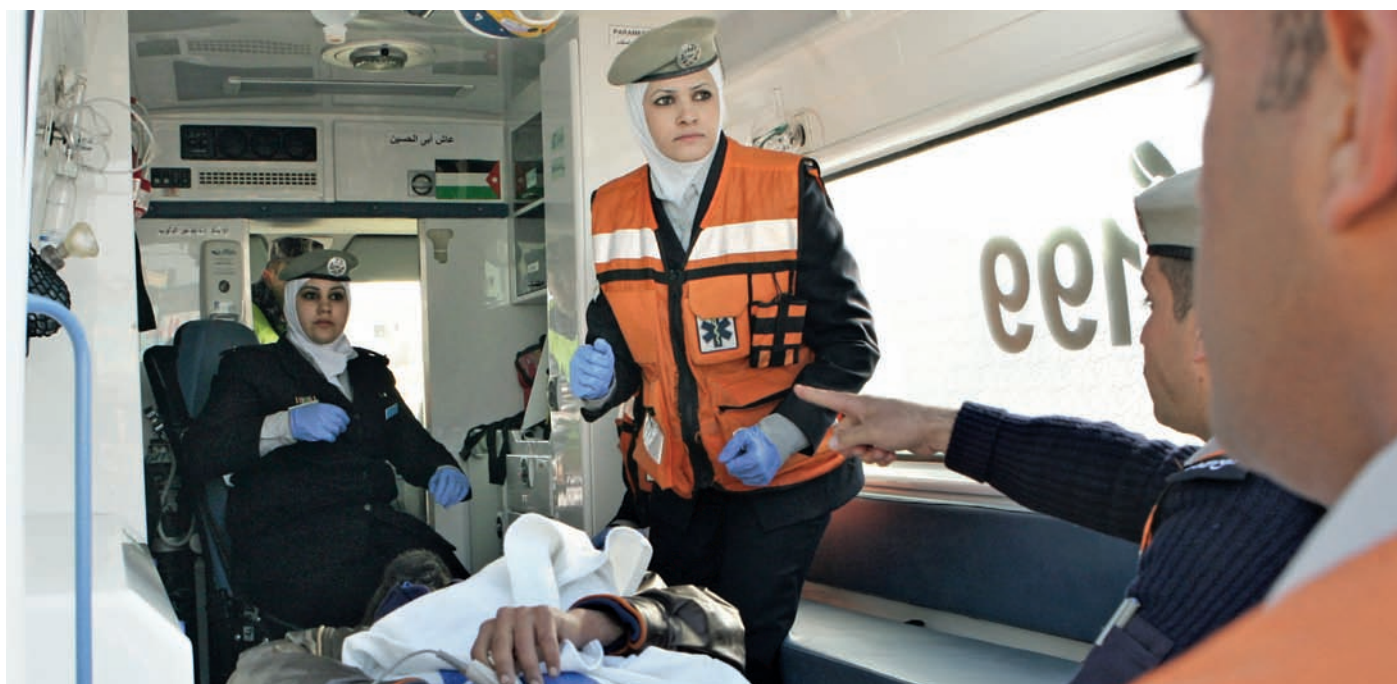
Female Jordanian medics react during a first aid training in a car ambulance

http://www.ilo.org/global/about-the-ilo/newsroom/features/WCMS_213754/lang--en/index.htm