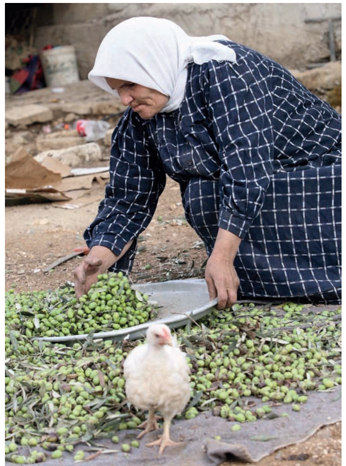
A woman prepares olives for pressing (© ILO/Apex – ILO Arab States Flickr). (© ILO/Jared J. Kohler – ILO Arab States Flickr).

The ILO and the World Health Organization are the lead agencies for promoting this UN system-wide effort to ensure basic social guarantees for all.