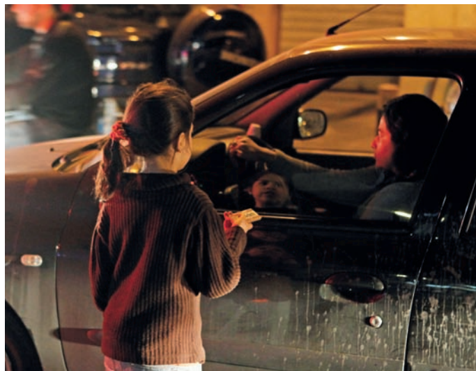
A young foreign girl sells gum (© ILO/Apex – ILO Arab States Flickr).

In Yemen , the results of the first-ever national child labour survey, conducted by the Central Statistical Organization and the ILO, were launched in Sana'a in February 2013. The survey provides indicators on three main aspects of children's lives: economic activity, schooling, and unpaid household services.