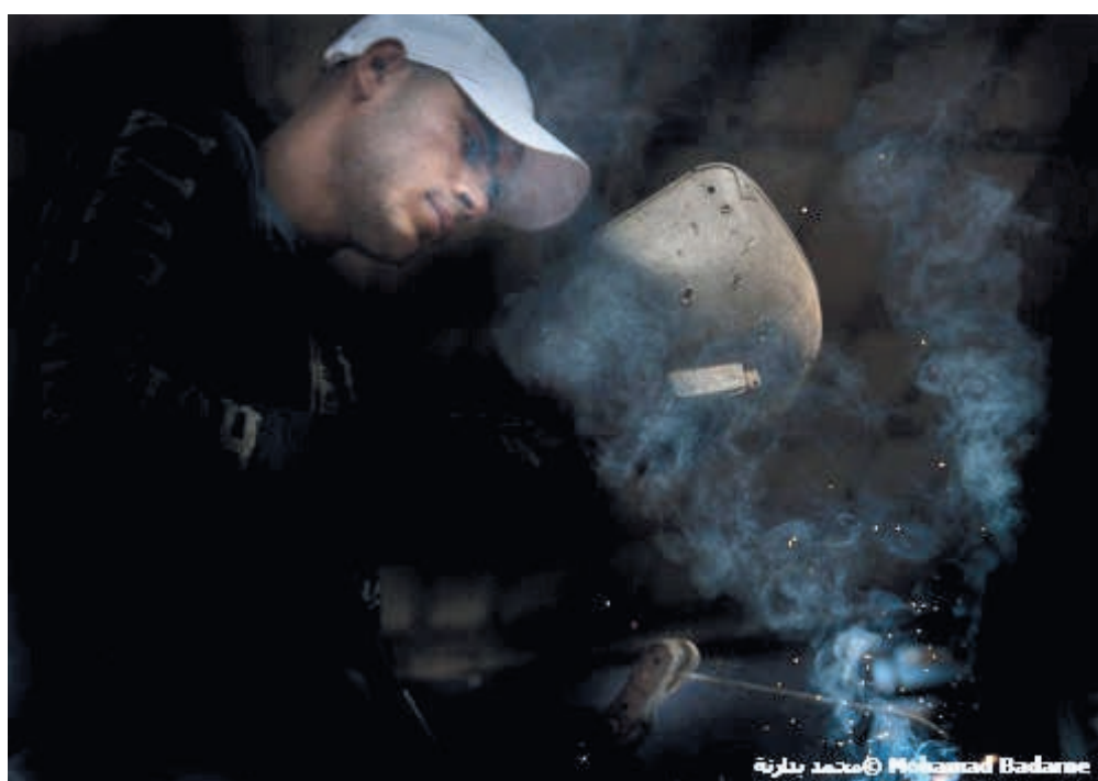
Palestinian worker.

http://www.ilo.org/global/about-the-ilo/newsroom/news/WCMS_215030/lang--en/index.htm