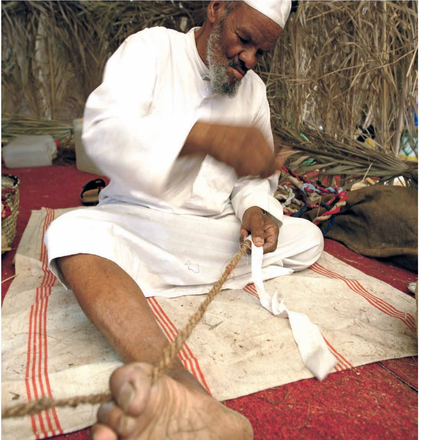
A migrant Yemeni laborer works on handmade crafts (© ILO/Apex Image - - ILO Arab States Flickr).