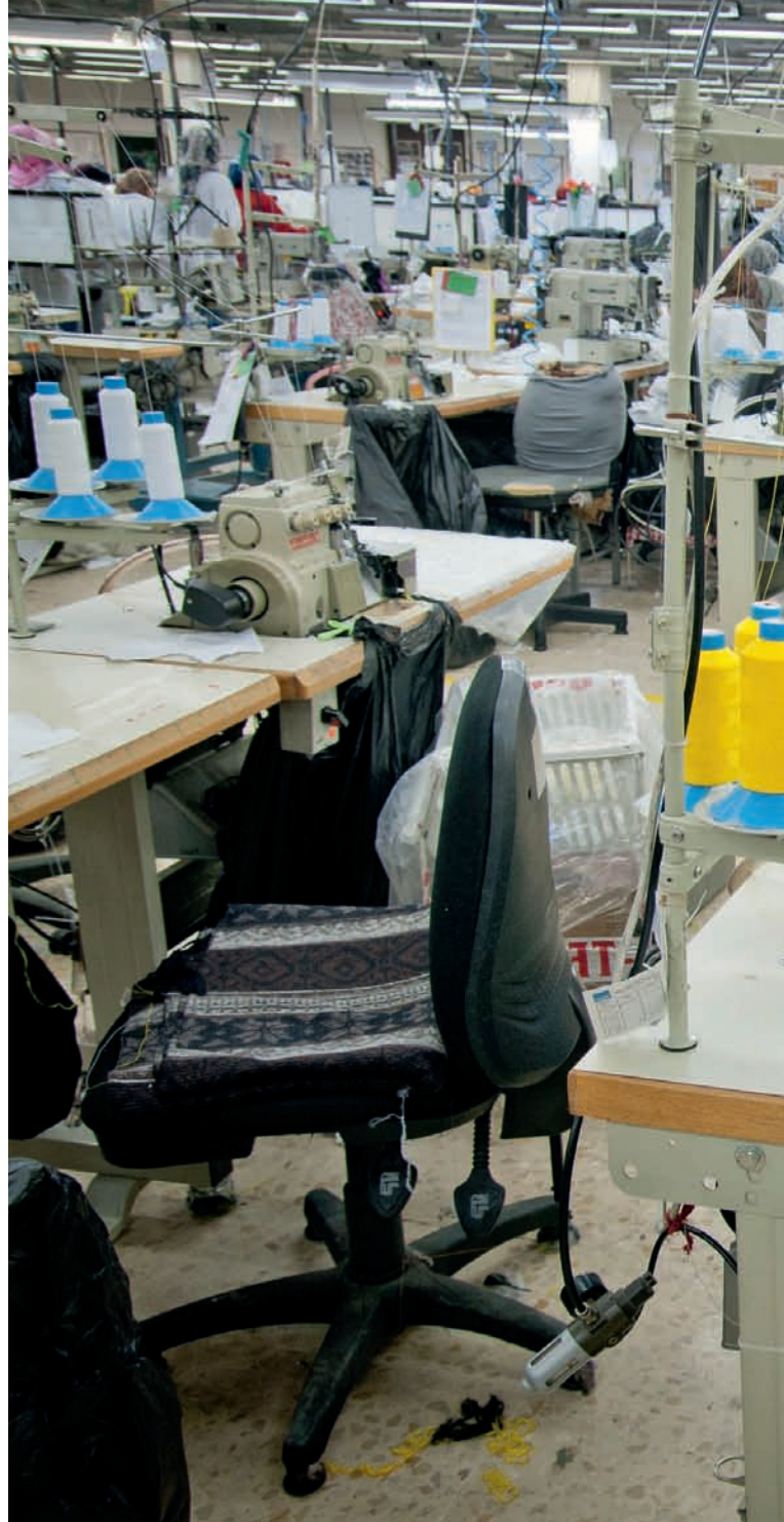
Jordanian workers are employed at a textile manufacturing facility in the Qualifying Industrial Zone near the town of Irbid, Jordan.

Over recent years, QIZ workers have held numerous strikes to protest against what they perceive as labour rights violations, low wages, and poor working and living conditions. In response, a collective bargaining agreement was signed in May this year between two apparel employers' associations and Jordan's union of garment factory workers. The agreement was widely viewed as an unprecedented step forward in the enhancement of social dialogue and