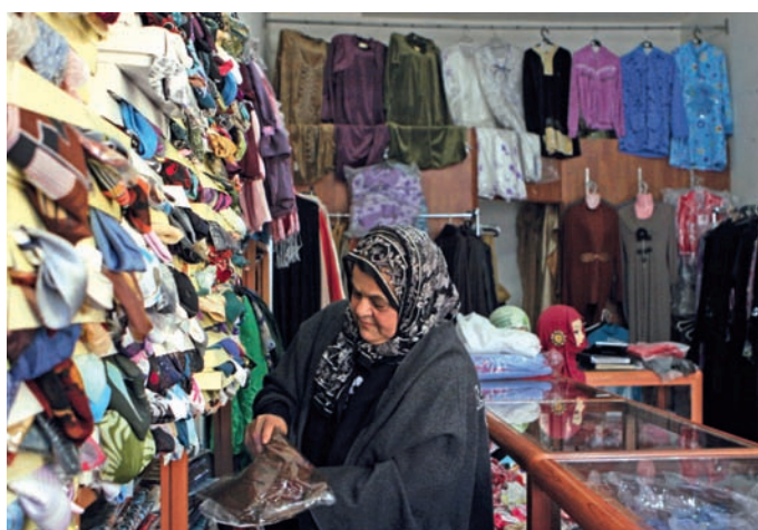
Palestinian Women's Entrepreneurs in Palestinian camps in Lebanon (© ILO – ILO Arab States Flickr).